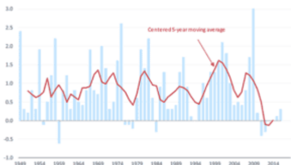
Figure 1. Contribution of Capital Investment to Productivity Growth

The final step is that faster productivity growth will translate into more compensation – wages and benefits – for workers. This tight historical relationship is shown in Figure 2. Recently, this proposition has somehow become controversial. AAF’s Ben Gitis artfully debunks claims to the contrary (and is also the source of Figure 2).