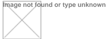
FIGURE 3: SECTION 1115 DEMONSTRATION WAIVER APPROVAL TIME AVERAGES

As seen in Figure 3, a section 1115 demonstration waiver approval process averages 234 days, over seven months. Once a waiver is approved, usually for a three to five year period, any amendments to the active waiver average an approval time of 216 days, and the renewal of an existing waiver set to expire averages approval time of 276 days. As seen in the graph below, it takes a month longer to approve a program renewal – on average- that it does to approve an original demonstration program. The section 1115 FP approval is a separate case because section 1115 FP or Family Planning waivers are similar in nature in that they each offer a set of family planning benefits. However, according to CMS data, approval time for a section 1115 FP waiver averages almost one year – 361 days.