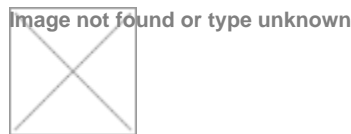
FIGURE 1: THE AVERAGE NUMBER OF DAYS FOR WAIVER APPROVAL BASED ON TYPE OF APPROVAL NEEDED

The data shows that original waivers have the longest wait time for approval at 337 days, followed by renewals/extensions at 199 days, and amendments at 177 days. This is most likely due to the level of complexity and burden of reviewing a new waiver. For an original waiver, CMS must review the entire program, weighing costs and benefits, whereas with renewal and amendments the agency is more likely to be familiar with the existing program. These wait times raise questions regarding the efficiency and effectiveness of the current waiver approval process. The range of days is very broad, varying from 0-1637 days for approval.