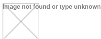
FIGURE 2: WAIVER APPROVAL AVERAGES ACCORDING TO THE WAIVER AUTHORITY UTILIZED

The approval time for section 1115 demonstration waivers is much higher than for 1915 (b) and 1915 (c) authorities. This could be due to the variation among section 1115 demonstrations, meaning that section 1115 waivers cover a larger number of services and care delivery models, taking longer for review.